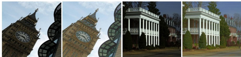
Figure 2. Original and Enhanced Natural Images